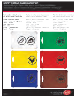
HACCP chart & stickers included in kits